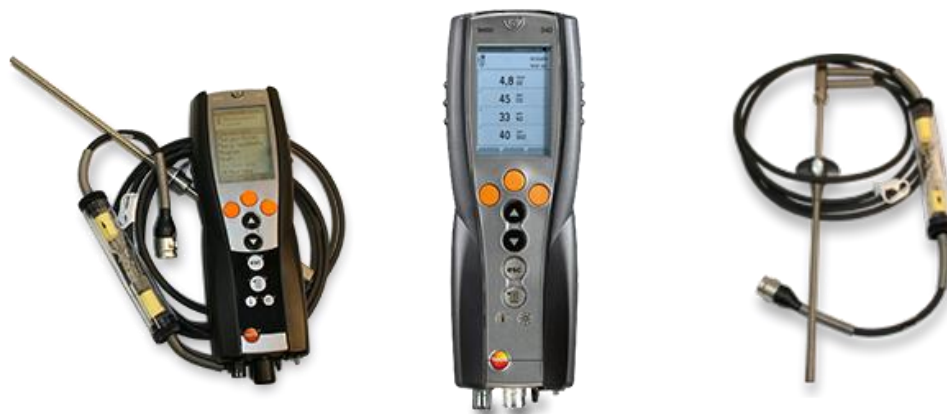
Testo 340- Flue Gas Analyzer.

Compliance Enviro Services high quality equipment are available to assess your indoor air quality. Now most of the customers are committed to environmental aspect. As a result Air Quality test is a vital requirement of customers. So Compliance Enviro Services is also committed to assess your indoor Air Quality with transparency & Quality. To assess this Air Quality we have to follow some standards, such as ECR, 1997, WHO, DoE, World Bank etc. Compliance Enviro Services has a air emission quality testing machine from Testo and the model is –TESTO 340-Flue Gas Analyzer.