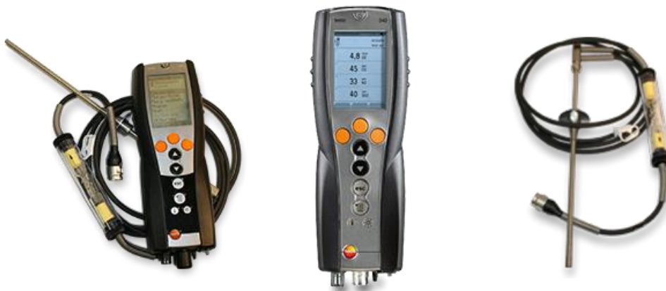
Testo 340- Flue Gas Analyzer.

Compliance Enviro Services high quality equipment are available to assess your indoor air quality. Now most of the customers are committed to environmental aspect. As a result Air Quality test is a vital requirement of customers. So Compliance Enviro Services is also committed to assess your indoor Air Quality with transparency & Quality. To assess this Air Quality we have to follow some standards, such as ECR, 1997, WHO, DoE, World Bank etc. Compliance Enviro Services has a air emission quality testing machine from Testo and the model is –TESTO 340-Flue Gas Analyzer.